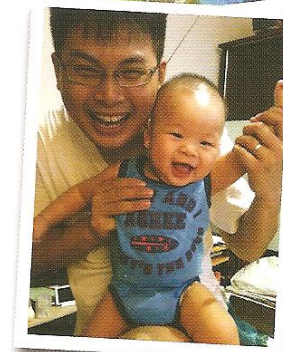
At home with daddy